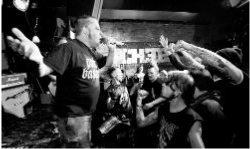
Peter & the Test Tube Babies